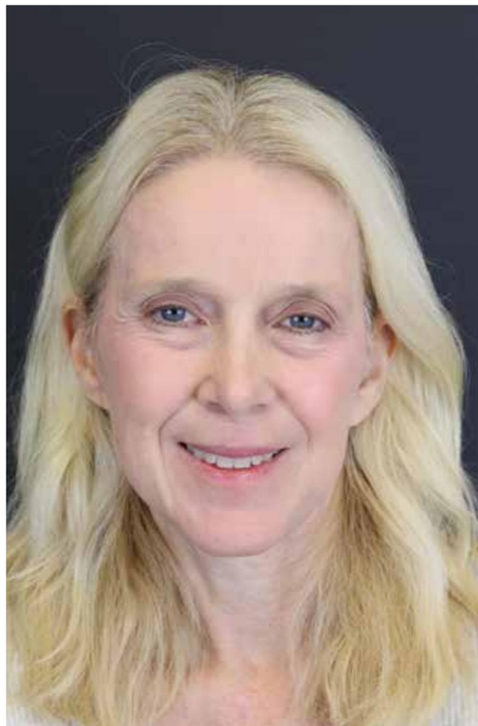
Before and After PreservaLift™ at RaggioMD.